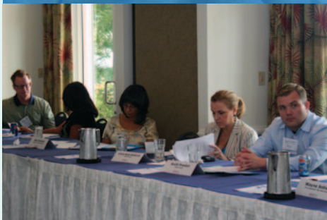
Members discuss committee priorities for 2010.