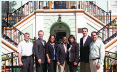
ARDA Caribbean USVI working group outside of the Senate building.