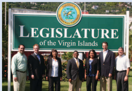
ARDA Caribbean USVI working group lobby for the enactment of ARDA-proposed property tax regulations.

ARDA’s experience here is a textbook example of the benefits of strong legislative and legal representation, intra- and inter-industry collaboration, industry research, and the financial support of ARDA Resort Owners Coalition (ARDA-ROC). Moreover, the manner in which we have conducted business in the U.S. Virgin Islands will serve as the model as we look to move forward into other jurisdictions in the Caribbean region.