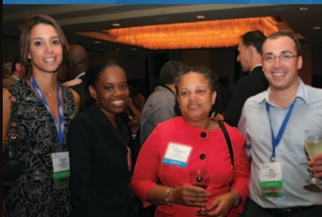
Team Interval International (Caribbean) discusses business opportunities with developers.