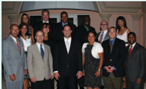
ARDA Caribbean hosts dinner for Governor John P. deJongh Jr. and Lieutenant Governor Gregory R. Francis.

The ARDA Caribbean Committee hosted its first island-based meeting in conjunction with the Caribbean Hotel and Tourism Association's (CHTA) Annual Small Hotels Retreat on October 1–2, 2009, at the Frenchman's Reef & Morning Star Marriott Beach Resort in St. Thomas, U.S. Virgin Islands.