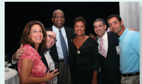
ARDA leadership and ARDA Caribbean members network with Aruba Timeshare Association leadership.